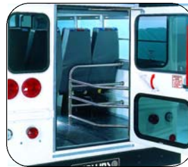
There are a number of options available

Everything you could imagine in the largest and best school buses, and many things you can only get in a plush conversion van.