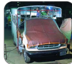
Steel construction safety cage for added strength and peace of mind

Collins builds the Collins Child Care Bus from the chassis up, engineering safety into every square millimeter. Available in single rear-wheel 9,600 lb. GVW, it features a reinforced, galvanized steel body, for bus-like protection in both head-on and side collisions. It also offers a smoother, sturdier ride, for added comfort and safety, with special child restraint seats to protect your precious passengers.