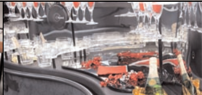
Shown with optional Wood Package.